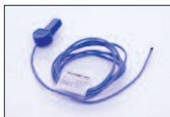
11730A73 Skin Probes Blue (6 pcs)