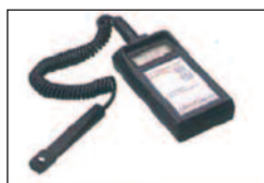
1749 Radiometer RM400