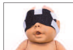
1645 Mask for Phototherapy (50 pcs)