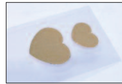
565 Sensor probe fixer Gel Reflect Ø38 (24 pcs) 11814A73 Sensor probe fixer Gel Reflect Ø26 (24 pcs)